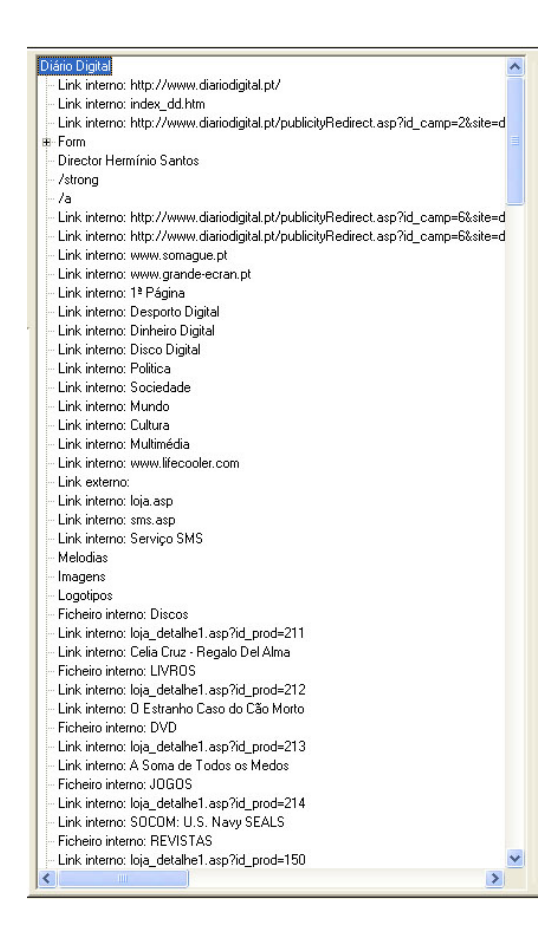
Figure 2: Normal View of the Document.