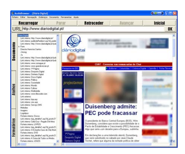
Figure 4: The AudioBrowser

Another example where the benefits of bookmarking a specific location of a web page would be of great use is to allow users to skip text in the beginning of the document. A significant number of pages have