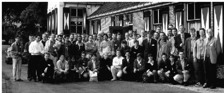
Figure 3. Attendants of the first international Scale-Space conference, Summer 1997 in Utrecht, the Netherlands, chaired by the author (standing fourth from right).