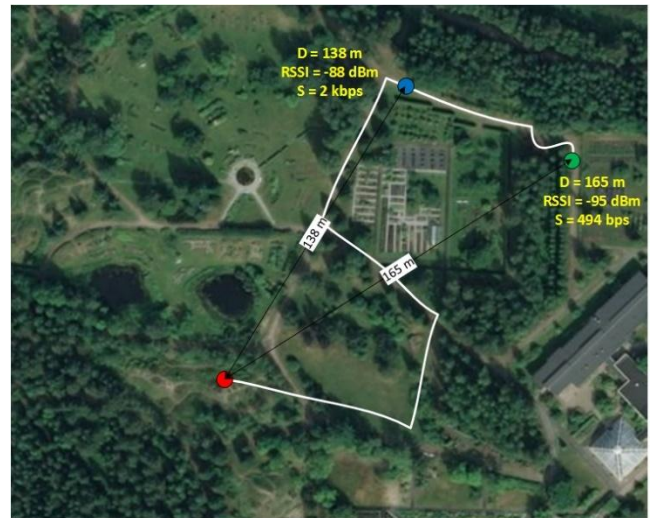
Figure 7: Walking path and results of NLOS Scen1.