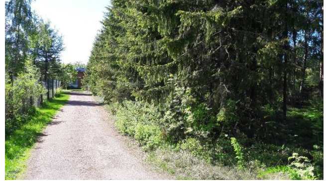
Figure 10: Vegetation at the point where BLE 4 connection was broken in NLOS Scen2.

In the second outdoor NLOS scenario (Scen2) the Rx node was 1 m above the ground level and the vegetation was dense as illustrated in Figure 8. The walking path and results are illustrated in Figure 9. In BLE 4 case, the connection was broken at the point which is shown in Figure 9 by using a blue circle. We can see from the result that the achievable communications range through a heavy vegetation was 90 m. Average throughput for this walking path measurement was 170 kbps. Vegetation at the end point of this case is shown in Figure 10 and from the starting point towards the end point is illustrated in Figure 8. Then BLE 5 coded mode was measured using the same transmit power of 0 dBm. The point where the connection was broken is shown using a green circle in Figure 9. We can see that this mode was able to increase the communications distance to 123 meters. However, it must be noted that the vegetation is not homogenous through the measurement path as can be seen from the Figure 9.