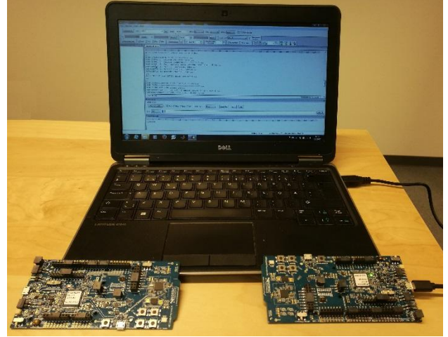
Figure 1: Devices used for measurements.

Note, that at a time of our experiments the support for BLE 5 functionality by nRF52840 chipset was limited to enablement of LE 2M and 125 kbit/s LE Coded PHYs in data channels only. Prior to this, the connection has to be established using LE IM PHY. This limitation has sufficiently affected the procedure of our measurements. Namely, in the initial phase the two devices were placed close enough to each other to enable them establishing the connection using the desired parameters (i.e., maximum transfer unit size, data channel PHY, transmit power, connection interval, etc.). After this, one of the devices (the one receiving the notifications – referred further in the paper as Rx node) was kept static and the other one (Tx node) was moved away from it until the connection was broken. This enabled us to detect the maximum communications range for particular set of parameters. Within this range we have selected few points and measured the average throughput and RSSI in order to investigate how the propagation environment affects the performance of BLE communications.