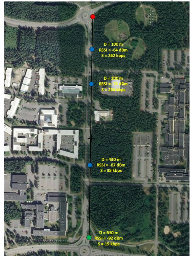
Figure 3: Results of the first outdoors LOS measurements.

The second outdoor LOS measurements were conducted on a longer straight (~1 km) bicycle road to find out the maximum communications distance also for BLE 5 coded mode. In order to complement the set of previous measurements, we measured at first BLE 4 and BLE 5 coded mode performances using transmit power