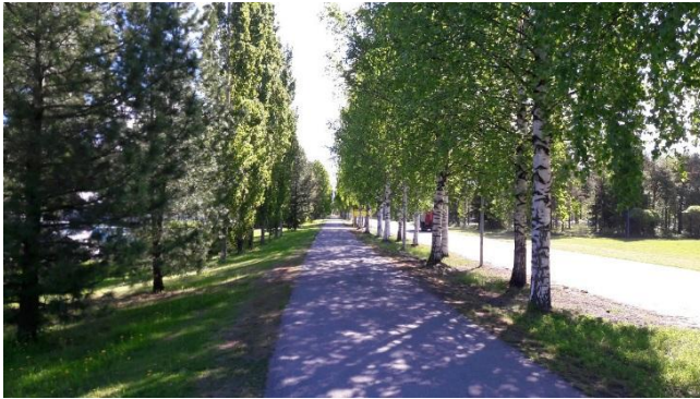
Figure 4: Straight bicycle road used for LOS measurements.

Results are shown for each case in Figure 5. The RSSI and throughput values just before connection break are shown for each case. Red circle is the RX point and blue circle is the point where BLE 4 connection was broken. Yellow circle is the point where BLE 5 mode with transmit power 0 dBm stopped working, and green circle is the point where connection was broken when using BLE 5 mode with transmit power of 9 dBm. From the results of Figure 5 it can be observed that for BLE 4 with 0 dBm, the maximum range was 220 m. For BLE 5 case with 0 dBm transmit power, the communications range was found to be 490m. In the previous outdoor measurements it was found that for BLE 4 with 9 dBm, the maximum range was 430 m. Therefore, the BLE 5 coded mode can achieve longer range with 9 dB lower transmit power (0 dBm). Figure 5 shows that the communications range for BLE 5 coded (S = 8) mode with transmit power of 9 dBm is very impressive, being 780 meters.