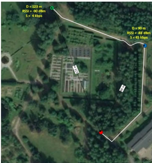
Figure 9: Walking path and results of NLOS Scen2.