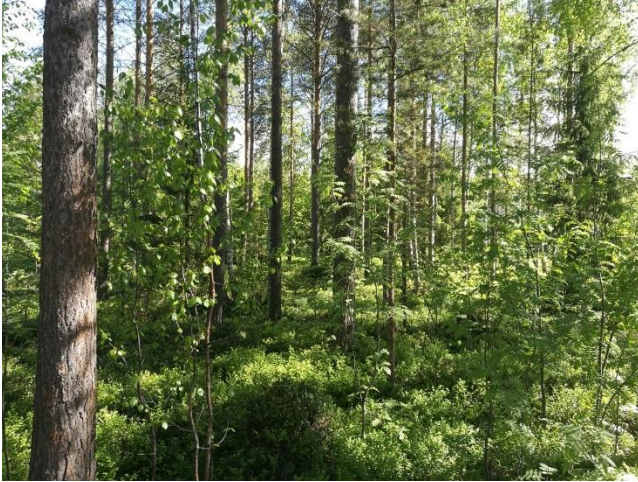
Figure 8: View from the Rx node position in NLOS measurement Scen2.

In BLE 5 case, the connection was working longer, as expected, and was broken at a point marked with green circle in Figure 7. However, the range improvement is not drastic in this NLOS scenario. The NLOS path was very difficult at the point where BLE 5 connection was broken since there was a dense tree stand. The final measured RSSI value before connection break was -95 dBm and throughput was 494 bps. This behavior is somewhat similar to the NLOS indoor case since the relative range improvement is not very large.