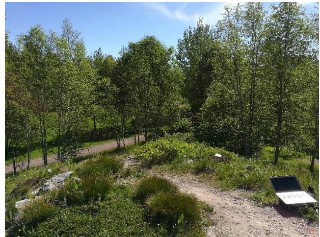
Figure 6: View from the Rx node position in NLOS measurement Scen1.

In BLE 4 case the connection was broken at the blue circle point shown in Figure 7. Connection quality was good via the shown walking path at the garden, average being 190 kbps, even there are trees and bushes blocking the signal between Tx and Rx nodes. The final measured RSSI value before the connection break was -88 dBm and throughput was 2 kbps.