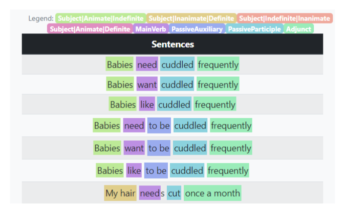
Fig. 2. Example of the annotations depicted by Linguists.

For the task of Sentence Annotation (AC2), another user interface is needed for the researcher to annotate the Sentences as she sees fit with the feature and relation vocabulary. For example, given the Sentence The cat needs fed. , the researcher can highlight part of the Sentence , such as The cat , and then annotate it with a feature vocabulary Subject . Some triples will be added into the Linguistic Feature Ontology , as discussed in Section 4.3.