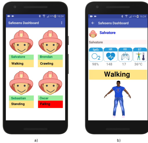
Fig. 2. Screenshots of the team leaders' application showing a) the dashboard, and b) the screen with details of the current HAR estimate.

In this demo we shall limit ourselves to the HAR component, for which we have developed an Android application whose initial screen is shown in panel a) of fig. 2. This screen illustrates the status of up to four first responders, showing, for each of them, the most recent activity, according to the output of the HAR algorithm, and highlighting it if and when appropriate—e.g., to issue a “firefighter down” alert if a firefighter is thought to have ceased moving and be lying on the ground. Team leaders can tap on a first responder’s icon to access a second screen (panel b) that provides more detail about the HAR estimate, and illustrates the most likely activity by means of a 3D model.