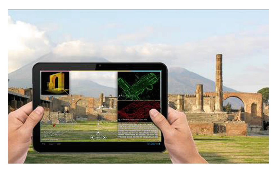
Fig. 1. INCEPTION "corporate" image. 3D digitization methods, post-processing tools for an enriched semantic modelling, web-based solutions and applications to ensure a wide access to experts and non-experts are the core of the project.

Moreover, the increasingly widespread use of different diagnostic methodologies and three-dimensional survey devices opens new scenarios within the non-destructive assessment and characterization of structures and materials, toward an overall and holistic digital documentation of cultural heritage [1].