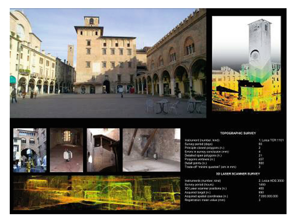
Fig. 2. Integrated digital documentation of complex heritage buildings. The example of Palazzo del Podestà in Mantua (DIAPReM Centre).

Advanced 3D documentation identifying different layers of data to be recorded for heritage knowledge, enhancement and conservation is one of the main outcomes of the European Project "INCEPTION - Inclusive Cultural Heritage in Europe through 3D semantic modelling" (Fig. 1), funded by the European Commission under the Programme Horizon 2020 and started in 2015. The project proposes the enhancement of efficiency in 3D data capturing procedures and devices, especially dealing with complex heritage "spaces": cultural heritage sites, historical architectures, archaeological sites characterized by non-conventional features, location and geometries [4] (Fig. 2).