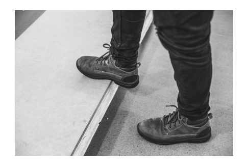
Fig. 3. Participant interacting with the ground board

All the experiments were taken in an experimental room where the research team had full control over the ambient variables. When receiving the participants, they were briefed about the study - the purpose of the study was not disclosed to avoid bias. To formalise their agreement in participating in the study, they were asked to fill a consent. A generic sociodemographic questionnaire was also filled to be possible to characterise the sample (age and gender) - no sensitive personal data was collected as well as all the data was anonymous. As the experimental setup included a ground board that required participants to step on it (Fig. 3), participants were told to be careful with the ground obstacles as they could physically exist. This ground board was synced between the VE and reality, so the player could see this ground board in the game and step on it physically like it was real. To be sure players could sense the scent, we asked them if they had any limitations in breathing through the nose or detecting scents. If the response was positive, and to not compromise the experiment, players would perform conditions that did not consider multisensory stimuli.