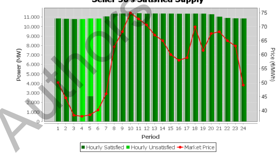
Seller 38's Satisfied Supply

Fig. 6 presents the results achieved by Seller 38 for each hourly period of the considered day. As it is possible to notice, Seller 38 sold almost all its available power for the 24 hourly periods of the day. In periods 4 and 6 Seller 38 was not able to sell any of the offered power. In turn, in period 5, this agent is the one who determines the market price (agent's bid price is equal to the market price), being only able to sell less than <sup>1</sup>/<sub>4</sub> of its available power. Market prices vary approximately between €38 (period 4) and €75 (period 10).