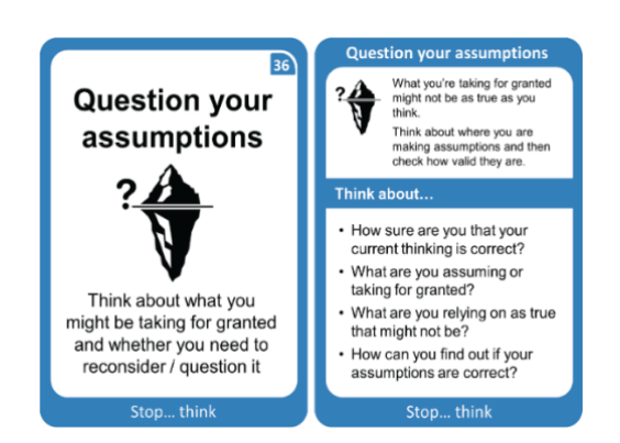
Fig. 2. Tactic card design, front (left) and rear (right)

The top panel of the card rear repeats the icon in a smaller size, for continued visual recognition if the card is turned over, flanked by a short description of why/how the tactic might be useful. The lower panel contains a list of open questions, which aim to prompt reflection. The category name appears at the bottom of both sides and the title of the card is repeated at the top of the rear, so the card can still be identified when turned over. Categories are colour-coded, using a colour scheme designed for maximum visual difference [10]; cards are bordered in their category colour and a band of the same colour visually separates the two information panels on the rear.