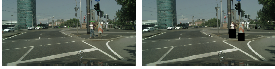
Image example from CityPersons including the ground truth as green bounding boxes [27]