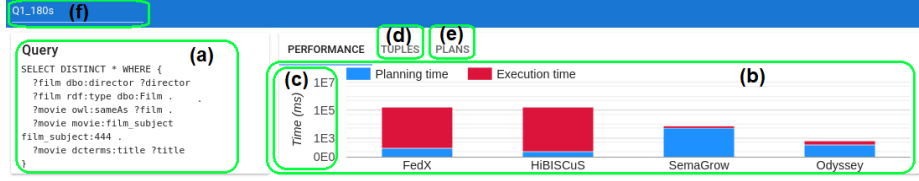
Fig. 3. Performance of the federated query engines for Q1

clicking on “PLANS” (Fig. 3(d)) or examine the query answers by clicking on “TUPLES” (Fig. 3(e)). The analysis of Q1 is saved to the browser’s local storage after giving it a name (Fig. 3(f)).