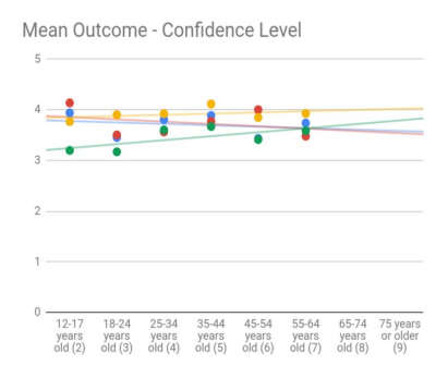
Figure 4: SDT Mean Outcome for Confidence Levels showing the confidence level. Misclassifying phishing email(red) is associated with the same confidence as correct rejection for 12-17 (yellow), with confidence falling with age. False alarm is shown with least confidence in ages 12-17, and increases with with age.

confident) could be the same as another participant's 3 (average confidence). Their perceived confidence could also shift throughout the survey; a response of 1 (least confident) could be changed to a 2 (lower confidence) or 3 later on, depending on whether or not the participants believed that the questions were more or less difficult at the beginning of the survey.