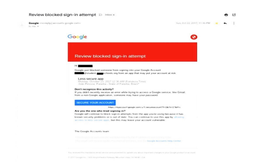
URGENTI CLICK THE LINK TO VIEW THIS DOCUMENT NOW!

Phishing examples were adopted from the Berkeley Phishing Examples Archive (PEA) <sup>1</sup>. The adopted phishing emails were modified to include the name of the school and actual school activities, including grades and exams. The images were edited to address the participants' real names and roles (teacher or student). Google documents addressed school-specific information to check the participants' susceptibility to spear phishing emails. The signals that were used in the phishing emails were (a) the greeting, (b) suspicious URLs with a deceptive name or IP address, (c) content that did not match the ostensible sender and subject, (d) requests for urgent action, and (e) grammatical or typographical errors. We selected this set of signals based on a 2016 study by canfield et al. that similarly focused on detection theory, albeit using an online survey of people aged 19-59 [2].