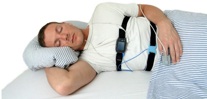
Fig. 2. Sleep and vegetative sensors.

but also health-related variables such as disease duration and medication intake. This questionnaire supports better classification of the qualitative data.