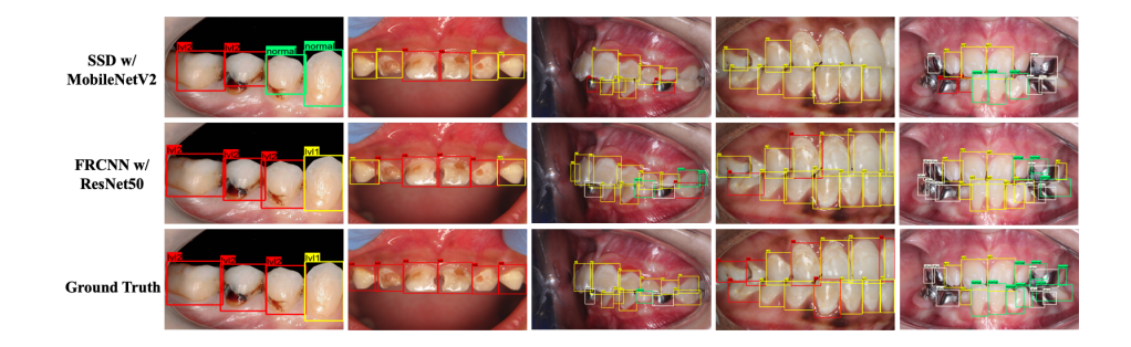
Fig. 4. Qualitative comparison between the cavity detection results by SSD and Faster R-CNN. Green boxes denote normal teeth; yellow boxes denote level 1 cavity; red boxes denote level 2 cavity; and white boxes denote human-imposed oral devices.