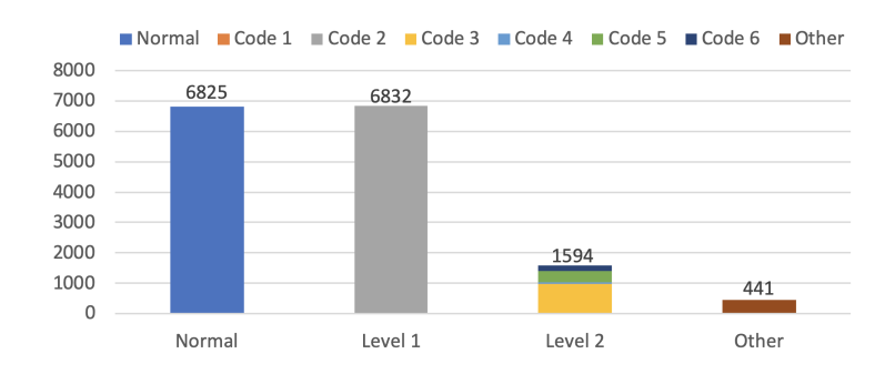
Fig. 3. Class distribution and the grouping schema of the intraoral dataset.

untrained general population to spot the cavity at codes 1 and 2. Therefore, in our task, it is sufficient to group codes 1 and 2 as category level1 that consists of teeth at early stages of cavity, and codes 3-6 as category level2 that consists of heavily cavitated teeth. The remaining 2 categories ( normal and other ) remain the same. The resulting distribution is shown in Fig. 3. We use the new 4category dataset to train our object detection models and apply class weighting to deal with the imbalance.