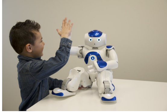
Fig. 1. A child interacting with the Nao robot