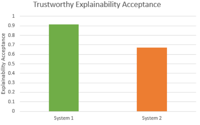
Fig. 3 Trustworthy Explainability Acceptance of System 1 (confidence: 0.99) and System 2 (confidence: 0.98)