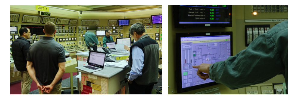
Fig. 4. Human factors researchers observing NPP operators interacting with the new HSI.

Human factors researchers and operationally experienced monitors observed the operators who performed actions in the scenarios using relevant procedures (see Figure 4). Observations focused on operator interactions that were affected by the upgraded controls and indicators. Changes in time available for operator action, as well as information availability, were identified by observers during the scenarios.