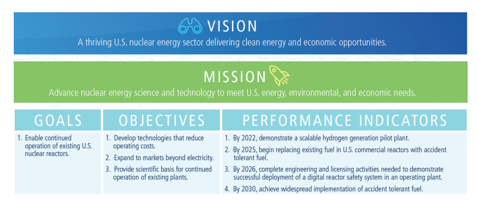
Fig. 1. Vision, Mission, Goals, Objectives, and Performance Indicators from the U.S. DOE-NE 2021 Strategic Vision. [1]

In January 2021, the United States (U.S.) Department of Energy (DOE) Office of Nuclear Energy (NE) published their strategic vision [1]. DOE-NE's strategic vision includes five goals, with supporting objectives to address "challenges in the nuclear energy sector, help realize the potential of advanced technology, and leverage the unique role of the government in spurring innovation" (pg. 3). As seen in Figure 1, the first goal is to enable the continued operation of existing commercial nuclear power plants (NPPs) by conducting research and development (R&D) to create technologies that reduce operating costs and expand nuclear energy beyond the electricity market.