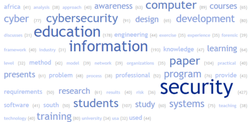
Fig. 3. Top Terms in Published WISE Papers

A total of 114 papers are currently available in the various proceedings published by Springer. A content analysis based on the title, abstract, and keywords of these papers provide some insight into WISE topic areas. The top terms are shown in the word cloud in Figure 3. The top five terms are: Security, Information, Education, Cybersecurity, and Computer.