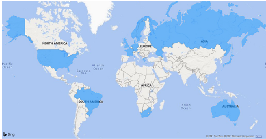
Fig. 1. Countries Represented by WISE Authors

During the 14 years in which WISE has been held, a total of 231 papers have been presented by authors from the 15 countries shown in the map below (Figure 1), including the USA, UK, South Africa, Russia, Sweden, and Norway. The contribution from each country is shown in Figure 2.