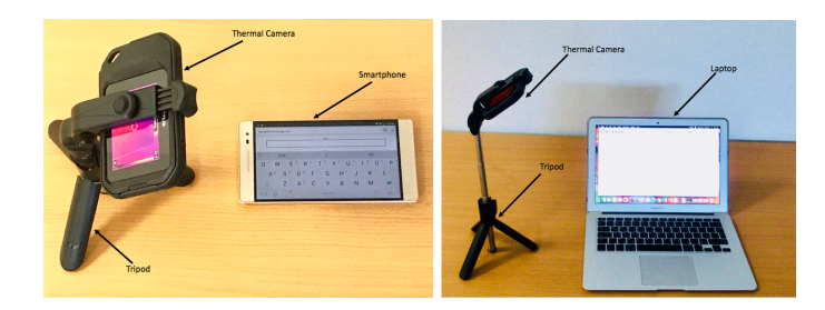
Fig. 1. The thermal images collection setup showing the input device, and the thermal camera placed on a tripod placed 30 cm away from the device.

Participants, Apparatus, and Setup We recruited 25 participants (16 males, 9 females) using a mailing list. Their ages varied between 18 to 23 (M = 21.32, SD = 1.14). Only one participant was left-handed and none of the participants had experience with thermal cameras. We used a Flir C2 Camera [2] thermal camera with resolution (80 px × 60 px). The camera was mounted on a 25 cm high tripod placed 30 cm away from the device (see Figure 1). Input was provided on a Lenovo Tango Phab 2 Pro smartphone with a gorilla glass screen (1440 px × 2560 px) pixels, and a MacBook Air Laptop (1440 px × 900 px).