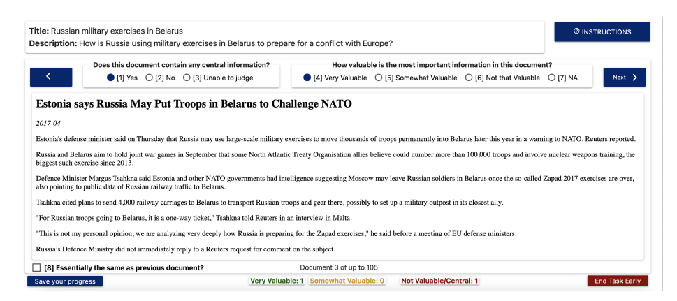
Fig. 1. Annotation interface for relevance judgments.

have led to more than twenty relevant documents for most selected topics. Thus, to support topics that went beyond esoteric facts, we treated only documents deemed central to the topic as relevant.