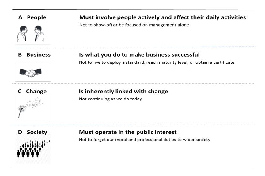
Figure 2: Introduction of a fourth Value to a revised SPI Manifesto