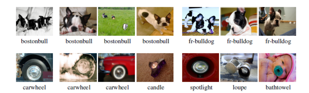
Fig. 3. Figure taken from F. Liu [93]: A tracing process for estimating influence, TracIn, applied on ImageNet. The first column is composed of the test sample, the next three columns display the training examples that have the most positive value of influence score while the last three columns point out the training examples with the most negative values of influence score. (fr-bulldog: french-bulldog)

Influential techniques can provide both global and local explanations to enhance model performance. Global explanations allow for the identification of training samples that significantly shape decision boundaries or outliers (see Fig. 1), aiding in data curation. On the other hand, local explanations offer guidance for altering the model in a desired way (see Fig. 3). Although they have been compared to similar examples and have been shown to be more relevant to the model [46], they are more challenging to interpret and their effectiveness for trustworthiness is unclear. Further research, particularly user studies, is necessary to determine their ability to take advantage of human cognitive processes.