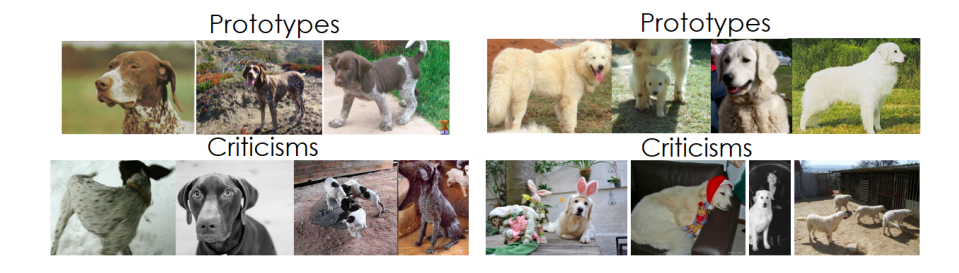
Fig. 4. Figure taken from [64]: Learned prototypes and criticisms from Imagenet dataset (two types of dog breeds)

Fig. 4 shows examples of prototypes and criticisms from Imagenet dataset. Prototypes and criticism can be used to add data-centric interpretability, post-hoc interpretability, and to build an interpretable model [82]. The data-centric approaches will be very briefly introduced.