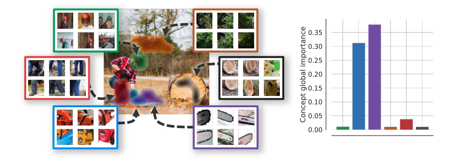
Fig. 5. Illustration from Fel et al. [35]. Natural examples in the colored boxes define a concept. Purple box : could define the concept of "chainsaw". Blue box: could define the concept of "saw's motor". Red box: could define the concept of "jeans".

Like in part-based XAI, the first concept-based method used labeled concepts. Kim et al. [66] introduced concept activation vectors (CAV) to represent concepts using a model latent space representation of images. Then, they design a post-hoc method, TCAV [66] based on CAV to evaluate an image correspondence to a given concept. Even though it seems promising, this method requires prior knowledge of the relevant concepts, along with a labeled dataset of the associated concepts, which is costly and prone to human biases.