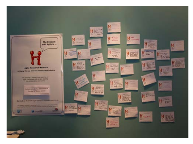
Figure 1: The Challenge Wall at ABC 2013

suggested that researchers should aim to understand the drivers of agile adoption as well as its effects [9]. The call for more research continued in 2009 by Abrahamson et al. [10], who also identified a need for more rigour and industrial studies, as well as highlighting a lack of clarity about what was meant by agility. More recently the research landscape has changed. Both Dingsøyr et al in 2012 [11] and Chuang et al in 2014 [12] have reported an increase in published research, indicating a maturing field.