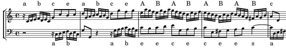
Fig. 1. Patterns used to model musical surface of Bach invention #01 in C major, taken from the first four measures of the soprano voice. All patterns have a duration of a quarter. The main patterns are a/A : four sixteenths in a upwards ( a ) or downwards ( A ) movement; b/B : four sixteenths (two successive thirds) in a upwards ( b ) or downwards ( B ) movement; c : two eighths, large intervals; e : two eighths, small intervals.

abce|abce|ABAB|ABAB|c?AB|BBzz||--ab|--ab|--AB|--AB|eece|cees| ... --ab|--ab|eece|cees|abce|ec?z||abce|abce|ABec|ABec|ABAB|ABAB| ... ... |abAA|BbAz||ABss|abss|ABss|abss|abab|abcz|AB??|----|| ... |c?AB|BBcz||--AB|ssab|ssAB|ssab|eece|ceAB|ceaz|----||