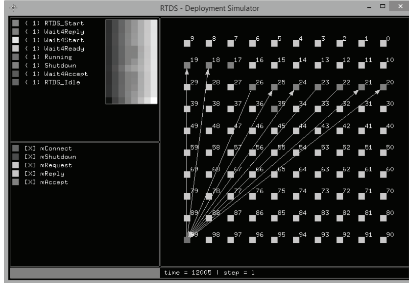
Fig. 3. Deployment simulator interface with live and post-mortem traces.