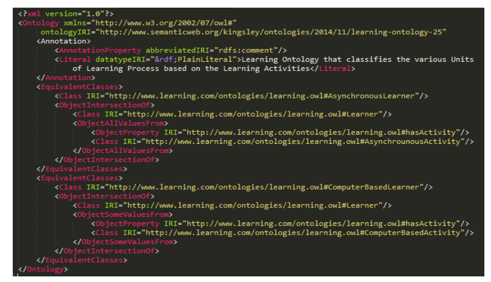
Fig [2]. A fragment of the Learning Ontology OWL 2 XML file in Protégé

Driven by the variables as defined in the Learning Ontology in Fig. 1, and the OWL 2 XML file Fig. 2, the resulting rules expressions Fig. 3, were derived to improve the reasoning capability and semantics of the learning process model.