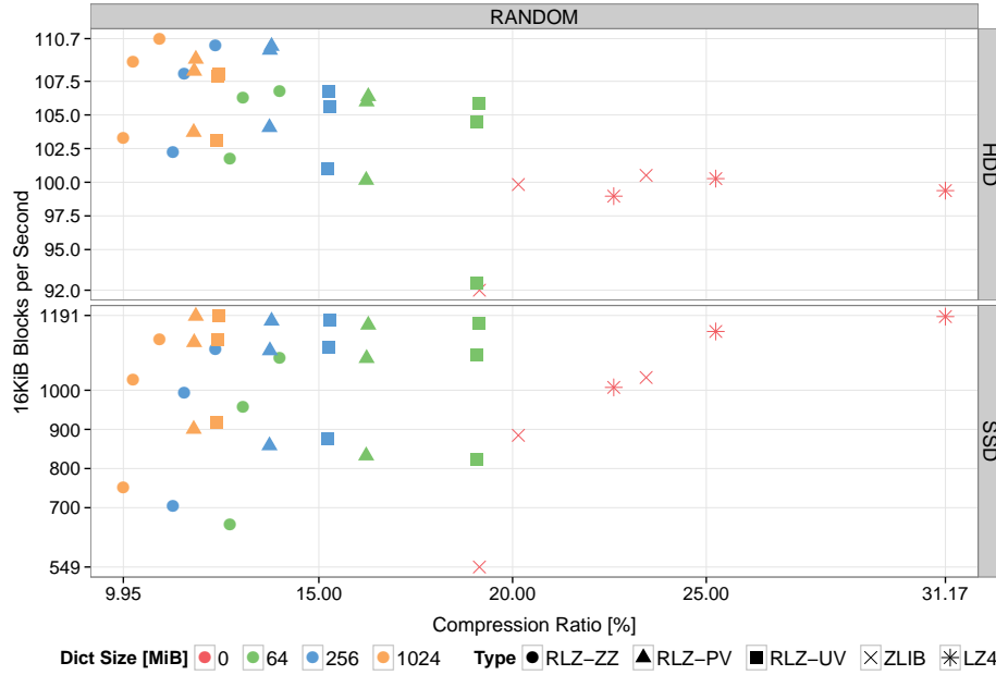
Fig. 3. Query processing rates for the RANDOM processing mode, measured as unaligned 16 kiB units retrieved per second, for two types of secondary storage, block sizes of 16 kiB, 64 kiB, and 256 kiB (not individually identified in the plots), and the full GOV2 collection. Note that the upper and lower panes have different vertical scales.

Detailed View – Random Access Figure 3 shows a focused view corresponding to the two right-hand panes in Figure 2, measured using the full 426 GiB GOV2 collection, and with the COPY method omitted. It considers only the RANDOM queries, using correspondingly larger dictionaries of 64 MiB, 256 MiB, and 1 GiB, and unchanged block sizes of 16 kiB, 64 kiB, and 256 kiB. At the increased scale of these graphs, it is possible to identify a Pareto frontier for each different dictionary size, and quantify the tension between compression and throughput that is controlled by block size.