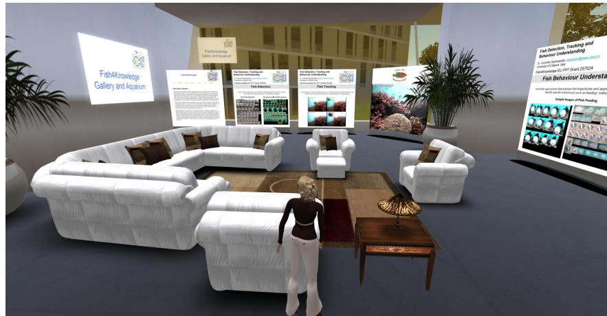
Fig. 2 Ground Level of the Exhibition Hall (East Facing)

Upon arriving at the ground level exhibition hall, the visitors can sit on our comfy virtual sofas to enjoy the surrounding or walk around the posters to view them. They can interact with or meet other visitors there or arrange to meet project representatives to talk about the project and its results. Once a poster is selected for viewing, the visitor can use a combination of [left-click] for locating and arrow keys to navigating their view. Currently, there are about a dozen project posters on display, with topics ranging from high performance computing, image processing, human-computer interaction, marine biology to virtual workflow machines.