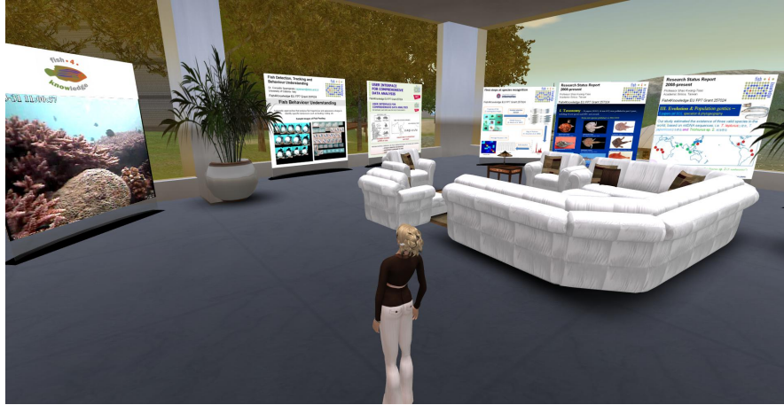
Fig. 3 Ground Level of the Exhibition Hall (South-West Facing)