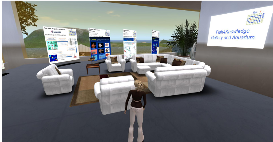
Fig. 5 Ground Level of the Exhibition Hall (West-North Facing)