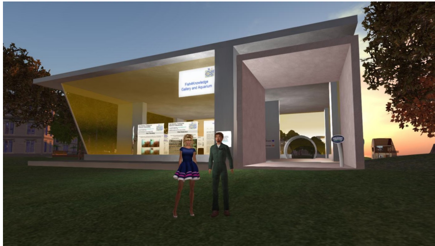
Fig. 1 Front of the F4K Virtual Gallery

As a result, we have selected Second Life as an experimental platform to host our F4K 3D Virtual Gallery. We were able to secure a piece of virtual land within Vue to build our gallery. What distinguishes this 3D virtual project demonstration area from our standard project web site ( http://groups.inf.ed.ac.uk/f4k/ ) is that the project demonstration is intended to be fun, interactive and educational. It is not just for academics, but also for everyone who has an interest in marine life and ocean conservation. We intended to use this virtual platform to attract younger people and their educators who have an interest in using computing technologies for educational purposes to get curious about our work and marine research in general. Figure 1 shows the front of the F4K virtual gallery.