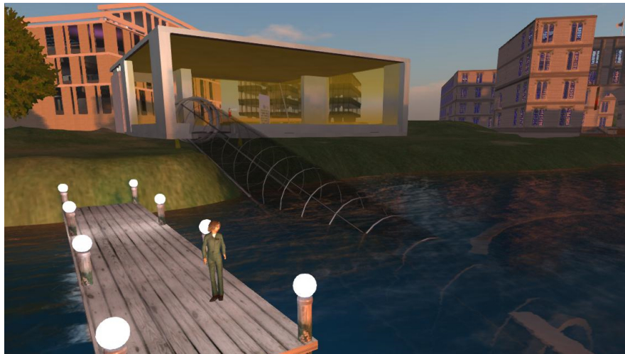
Fig. 6 Tunnel Entrance to the Underwater Level (external view)

gallery on OpenSim. An "OpenSim Archive" (OAR) file has also been created to support the replication of such facilities