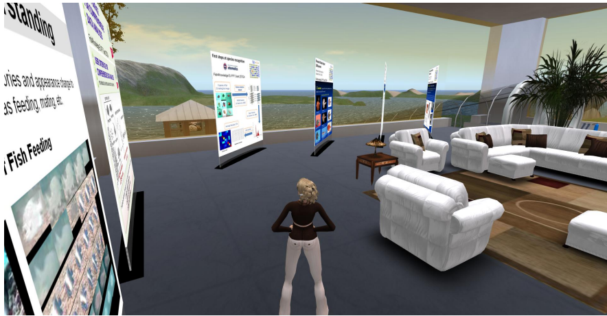
Fig. 4 Ground Level of the Exhibition Hall (West Facing)

captured in the coastal sea off South Taiwan that is a part of videos that have been processed by the Fish4Knowledge Team.