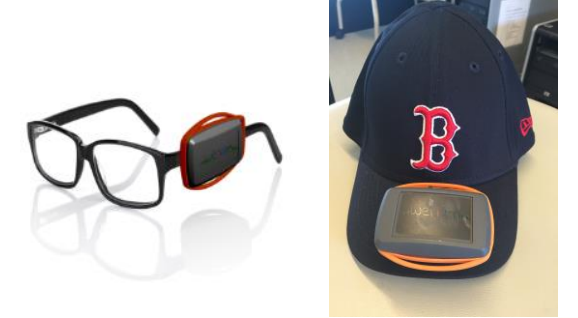
Fig. 2. The ENLAZA interface (Werium Solutions S.L., Spain)

assessment (by measuring the range of motion) [18] and the quantification of standing balance by assessing displacement of the center of mass in CP [19] and clinical assessment of tremor in Parkinson [20].