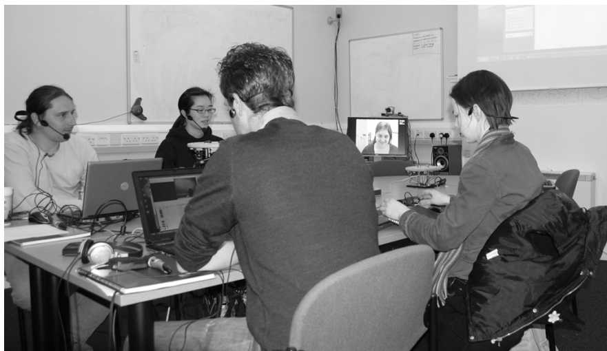
Fig. 16.1: AMI corpus recording setup.