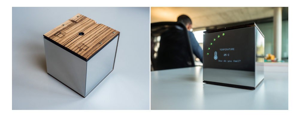
Fig. 2. ComfortBox is an interactive research tool designed to facilitate data collection in lab and in-situ comfort studies. The physical design is intended to help blend into the desktop setting and stay in the periphery of attention when not used.

runs on a MQTT server. This algorithm is tinkered by the experimenter and can work with input variables from the ComfortBoxes' sensor measurements, but also from other sensors used in the study. The buttons on top of the box allow for answering the posed questions.