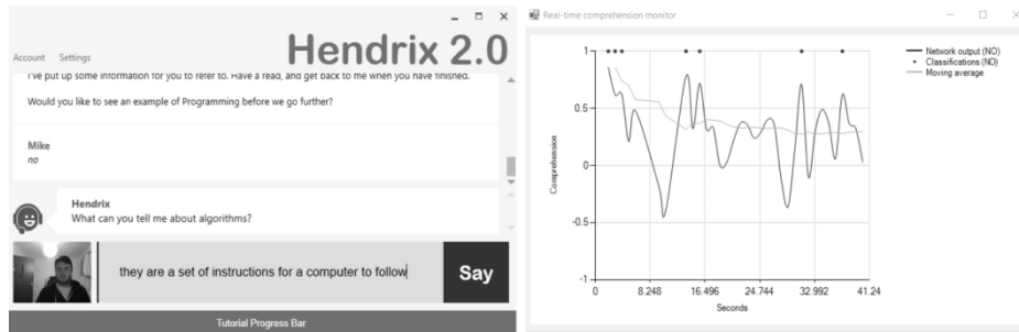
Fig. 1. Hendrix 2.0 chat interface window (left) and real-time comprehension monitor window (right)

Hendrix 2.0 integrates two novel artificially intelligent systems: a novel conversational intelligent tutoring system, based on Hendrix 1.0 [15], and a novel comprehension classification and scoring system, now called COMPASS [14].