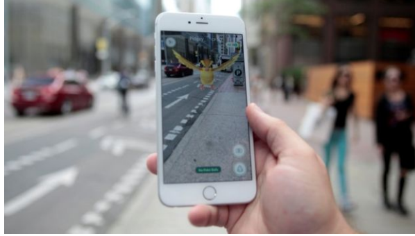
Fig. 1: Pokémon Go on iOS [5]