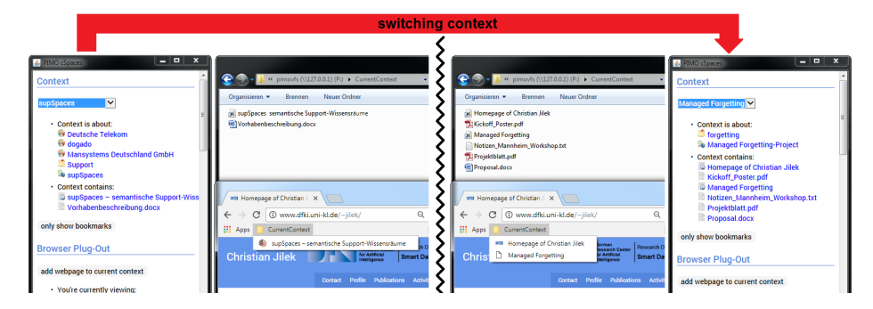
Fig. 2. Screenshot showing sidebar, file explorer and browser before (left half) and after a context switch (right half), illustrating the effects of a dynamic reorganization of the system. (Note: windows were rearranged for easier comparison.)

Demo. In an early proof-of-concept implementation based on [5], we already realized some of the file system, browser and calendar parts. The screenshots in Figure 2 show a typical feature of our system: the user selects a different context