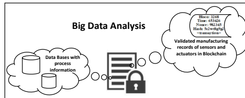
Fig. 2. Analysis of information by Big Data.

Once all the information has been stored, they can be analyzed in detail through Big Data. In Fig. 2 below, all the information from the validated and secure SCM processes by the blockchain platform as well as all the processes that have been stored in several databases, using Big Data technology, analysis of information can be carried out in order to obtain knowledge stored in the aid in the decision-making process.