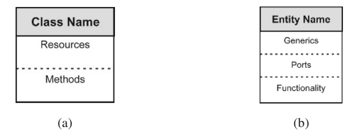
Fig. 1. a) Standard UML scheme used for the class notation. b) Adopted notation for the VHDL entity \label{eq:hard_scheme}