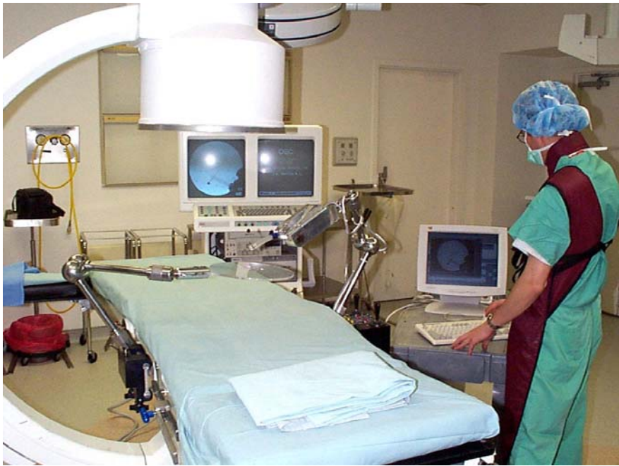
Figure 3: Experimental tests

A second set of experimental tests was then performed in the operating room (Figure 3) using a digital C-Arm fluoroscope (OEC-9600). The ball-finder pattern-matching algorithm proved to be stable and robust under this imaging modality. Imager distortion was evaluated by constructing a template of equally spaced steel balls mounted on a thin radiolucent plate. For the imager used the overall distortion was found to be under 0.75 mm in a region next to the image center, this including the error of the ball-finder algorithm. Using the magnification function of the fluoroscope allowed for maintaining the field of view in the reduced distortion zone around the image center. Using a 2mm ball target located 80mm below the needle tip (fulcrum / skin entry point) the image guidance algorithm was evaluated for targeting accuracy. The maximum error in aiming the ball over 25 experiments was under 1.5mm.