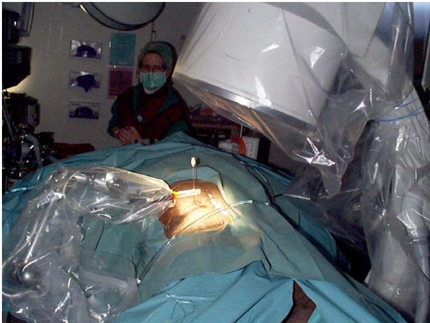
Figure 4: Fluoro-servoing percutaneous renal access at the Johns Hopkins Medical Institutions

For renal access the operating room and the patient are prepared as for the standard procedure. The patient is placed under total anesthesia. The fluoroscopy table is equipped with a special rigid rail. The robot is mounted onto the rail on the side of the targeted kidney and covered with a sterile bag. The needle driver is sterilized prior to the operation. As for the manual procedure the C-Arm is positioned on the opposite side of the table and all steps prior to the needle access are performed as usual.