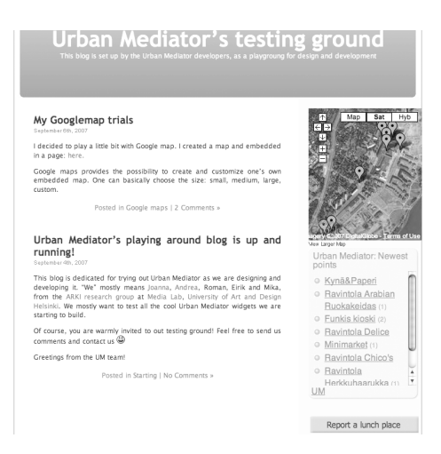
Fig. 2. A Google map showing UM data is embedded along with UM web widgets on a website (in this case the UM development blog).

Using mashups can lead to flexible designs benefiting from rigid, simple building blocks. This enormously facilitates overall design efforts as building blocks become more comprehensible by stakeholders than traditional building blocks found in software design. These extra components also served as means to illustrate possible courses of development and showcase for encouraging more collaborative, user-designable, ecosystemic software [21].