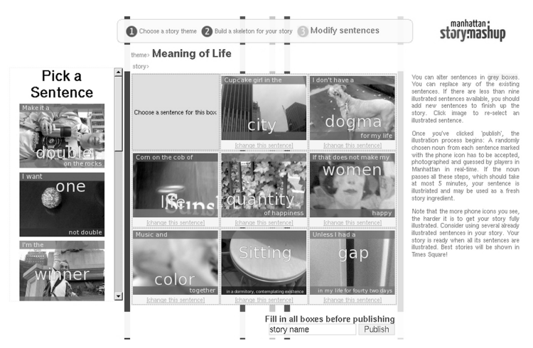
Fig. 3. Storytelling tool in the web.

Scheible and Tuulos [24] conclude that the system like Manhattan Story Mashup could well suit for educational purposes, even across city and country boarders. The use of video or other multimedia pieces would increase the presentation power over still images and would open many new opportunities on how the Story Mashup system could be utilized. In addition, Tuulos, Scheible and Nyholm [25] suggest that developers have to pay more attention to matching the physical and the virtual timescales, to the natural friction between the web and the physical world. Hence further experiments are needed to find best practices and design frameworks for successful interaction between the two worlds.