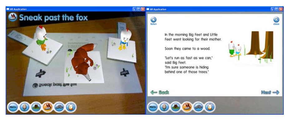
Fig. 2. Example for interactive screen (left) and text page (right)