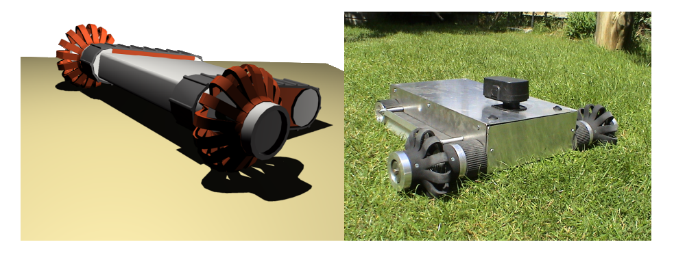
Fig. 2. Intelligent wheels conceptual model and prototype

Earlier work done at Middlesex University [17] on reconfigurable mobility systems include a concept known as intelligent wheels (Fig 2), which can change in size and form to adjust diameter, ground clearance, surface area and traction. The system will ultimately use the embedded sensors to carry out analysis on the local environment and using information learnt from previous experiences, the system could make adjustments to best suit the situation.