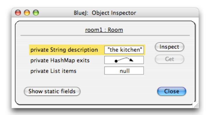
Fig. 5. Object inspection

BlueJ also provides a mechanism to instantiate classes from the standard Java class library. Users can then interact with these objects in the same way they do with objects from their project. This allows students to explore and experiment with library classes and objects. They can, for instance, directly interact with string objects or hash tables to observe their behaviour.