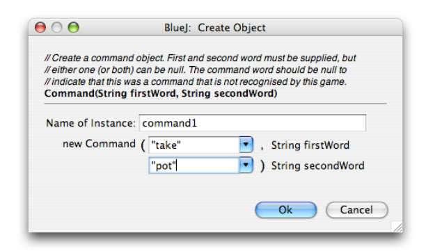
Fig. 3. A creation dialogue

Once the dialogue is confirmed, the constructor is executed and the resulting object is placed on the object bench.