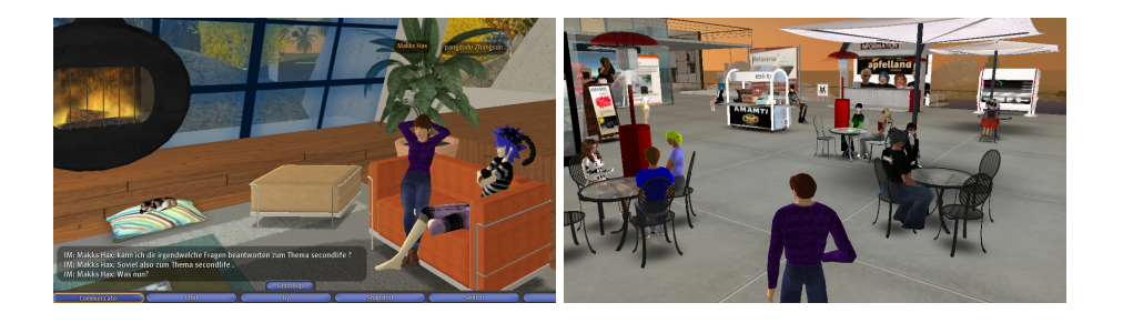
Fig. 2. Left picture: Max's avatar (left) and a human's avatar (right) engaged in a conversation. Right: A typical situation of Max meeting a group of Second Life residents socializing.

Upon these extensions, Max was able to enter the environment and communicate multimodally with human avatars and objects. He has access to over 100 in-built gestures (including facial expressions), autonomously navigates through the virtual world, follows avatars, and can access all user functions available in the official SL client. Figure 2 shows two screenshots of Max (or, more correct, his avatar) in SL.