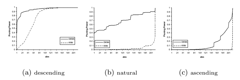
Fig. 3. Effect of Dimension Access Order on Pruning Power with fixed \varepsilon = 0.12 and K=300.

huge gaps. Compared with MAP result in fixed \varepsilon shown in Fig 2(b), MAP is further improved by setting an adaptive \varepsilon , which is less sensitive to large variances and able to achieve better results quality than fixed \varepsilon .