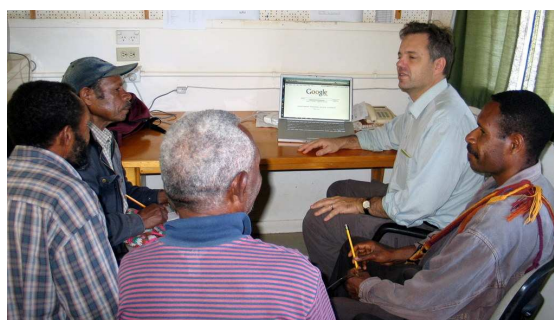
Fig. 5. Experiencing the Web and Online Access to Archived Language Data

Town-based oral annotation and transcription. In the third stage, we asked the language workers come to Ukarumpa, a centralized Western setting 20km away, near Kainantu, with office space and mains electricity. This provided a clean and quiet environment for text selection and oral annotation, plus the final step of the BOLD protocol: writing out the transcriptions and translations for a selection of the materials. The town context also permitted us to explore the issue of informed consent. Four speakers saw how it was possible to access materials for other languages over the Internet (see Fig. 5), and even listen to recordings of dead languages. As community leaders, they gave their written consent for the recorded materials to be placed in a digital archive with open access.