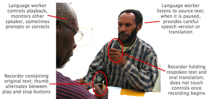
Fig. 2. Protocol for Respeaking and Oral Translation: the operator (left) controls playback and audio segmentation; the talker (right) provides oral annotations using a second recorder

The task of capturing oral transcriptions and translations onto a second recorder offers an array of possibilities. After trying several protocols, we settled on the one described here. The process requires two native speakers with specialised roles, the operator and the talker , and is illustrated in Fig. 2.