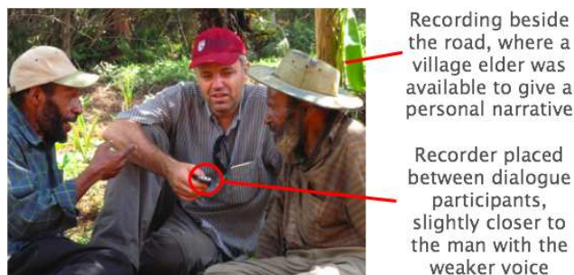
Fig. 1. Informal Recording of Dialogue and Personal Narrative

The initial task in Basic Oral Language Documentation (BOLD) is audio capture. Collecting the primary text from individual speakers is straightforward. They press the record button, hold the voice recorder a few inches from their mouth, and begin by giving their name, the date, and location. The person operating the recorder may or may not be the speaker.