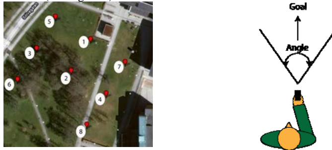
Fig. 1. A) The grid points for the test trails. B) The angle interval.

To see what happens in a completely open environment we also carried out three tests in an open field further away. The test tracks at both locations were based on a grid structure (see Fig. 1 A).