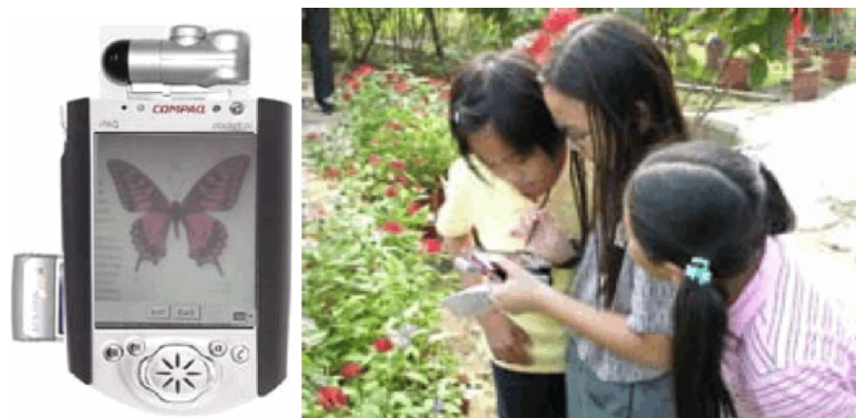
Fig. 1. The Butterfly-Watching System [1]

A possibility with mobile learning is to use the natural environment as a source of information. Some knowledge needs students learning through observation and is not very easy to teach by either traditional classroom teaching or web-based learning environment. Mobile application proves to be useful in this case. For example, the “Butterfly-Watching System” [3] supports an activity in which each learner takes a butterfly picture with a PDA (Fig. 1). Retrieval technique is applied on a database to search for the most closely matching butterfly information and is returned in real time to the learner’s device.