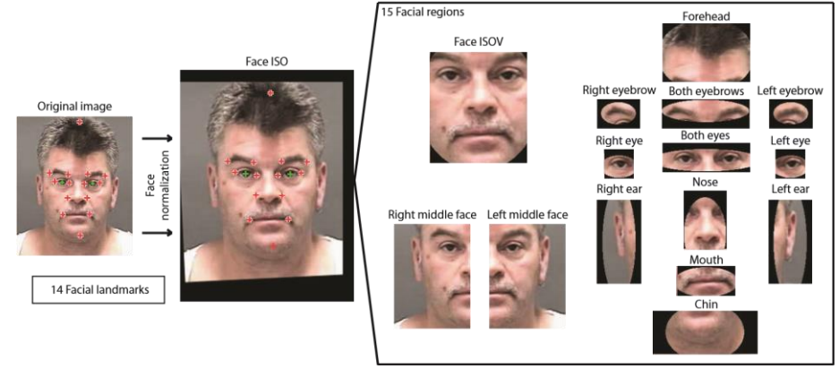
Fig.2. Facial regions extraction.

Understanding the discrimination power of different facial regions on a wide population has some remarkable benefits, for example: i ) allowing investigators to work only with particular regions of the face, ii ) preventing that incomplete, noisy, and missing regions degrade the recognition