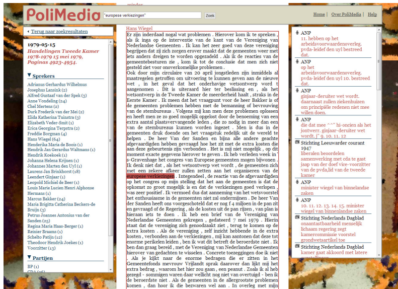
Fig. 2. Screenshot of the PoliMedia debate page

In order to navigate these links, SUI was developed in which the parliamentary debates are presented with links to the media coverage. The development was based on a requirements study with five scholars in history and political communication, leading to a faceted SUI as depicted in figure 1. Facets allow the user to refine search results, they support the searcher by presenting an overview of the structure of the collection, as well as provide a transition between browsing and search strategies [5]. During development, an initial version of this SUI was evaluated in an eye tracking study with 24 scholars performing known-item and exploratory search tasks [6].