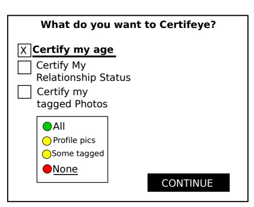
Figure 3: The main Certifeye interface

Finally, after consenting to the syncing of her Facebook account with her ODS profile, the user is presented with the main Certifeye interface, where (s)he can choose to certify relationship status, age, and/or photos (Figure 3). Observe that we embed trust in our design by envisioning periodic user interaction to "renew" the certification. After a user has gone through the Certifeye interface once, badges are not updated when her Facebook information changes. Therefore, after a set period of time, the badges revert to grey question marks. The Facebook API would actually grants ongoing access to a