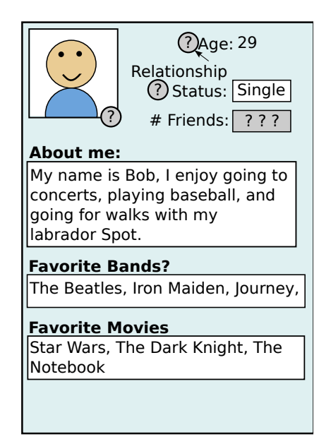
Figure 1: An example profile shown to users in our study.

(11/20) responded that they "simply refuse to post this information" and that no technical measure could change their minds. In the interviews, participants also revealed that certain information, such as address and/or phone number, was simply too private to be entrusted to Facebook. Overall, our analysis clearly showed that concerns about information disclosure were actually less relevant to users than the issue of veracity of information contained in profiles. Interestingly, all participants agreed that a Facebook profile contained enough information to make a decision about whether to date someone. This suggested that Facebook would be an ideal source of information to bootstrap trust in ODS.