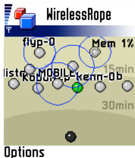
Figure 1. A screenshot of the Wireless Rope J2ME software. The black circle represents the owner, while devices in the environment are classified as familiar (green) or strangers (grey). Devices move closer to the black circle as they spend more time within range.

As part of the Cityware and Wireless Rope projects we designed and implemented a Bluetooth based infrastructure consisting of various components to combine these observation methods in a single system. There is a long-term installation in the city of Bath, UK. Demonstrations of Wireless Rope were given at the PerCom 2006 and Ubicomp 2006 conferences. A program for J2ME phones samples proximity data from the personal perspective (see Figure 1). It displays the current state of the environment visually to the user and provides basic statistical summaries, such as number of encounters and average meeting durations. Computers or embedded devices are installed at fixed locations of interest to perform augmented gate counts and augmented static snapshots. Additionally, these devices receive sample data from the mobile scanners via Bluetooth when in range. The stationary devices are connected to a central server, aggregating the data in a single database. We provide parts of this infrastructure to other researchers under the GPL license. 11 At the time of writing, we have collected 3.5 million records for about 60,000 unique devices in the course of a year in the city of Bath.